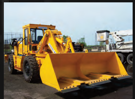
Track Cleaning Bucket