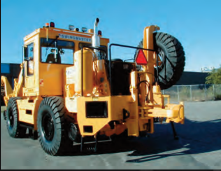
AAR Coupler Train Brakes