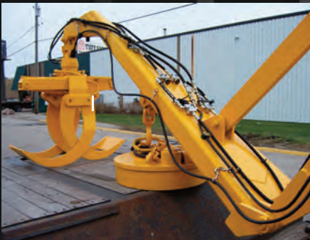
Magnet / Grapple Combo