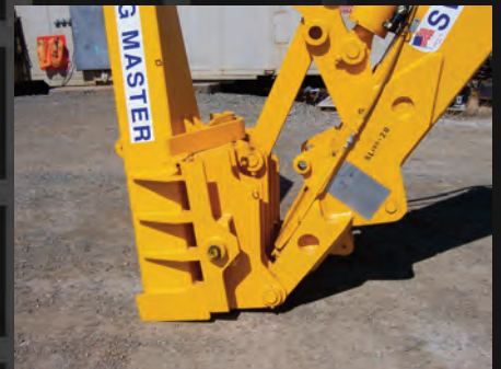
Male Master Coupler