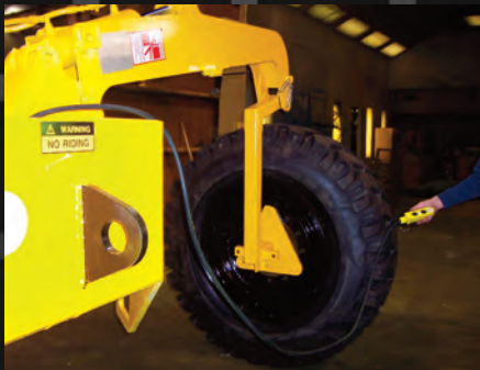
Spare Tire Carrier