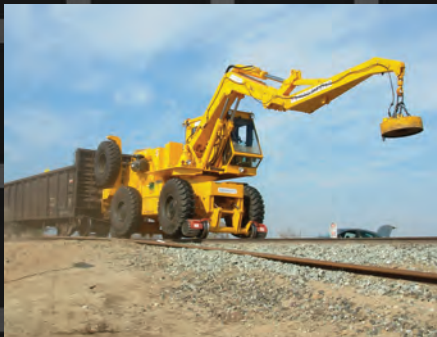
Magnet and Coupler